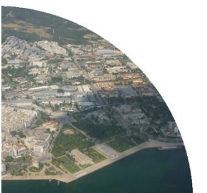
Protection and Restoration of the Environment XIV