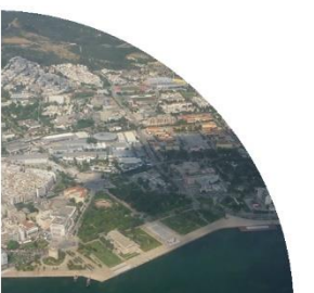
Protection and Restoration of the Environment XIV