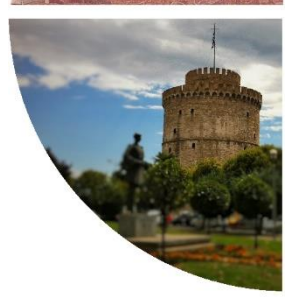
Protection and Restoration of the Environment XIV