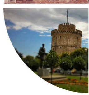
Protection and Restoration of the Environment XIV