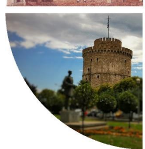
Protection and Restoration of the Environment XIV

Protection and restoration of coastal zone and open sea waters